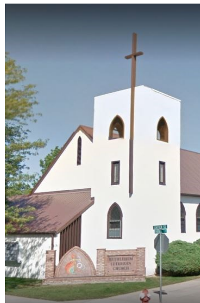
Bethlehem Lutheran Church