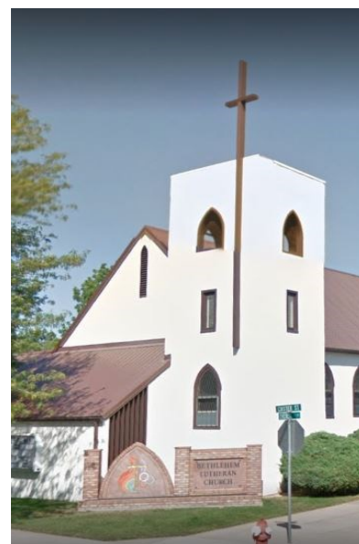
Bethlehem Lutheran Church